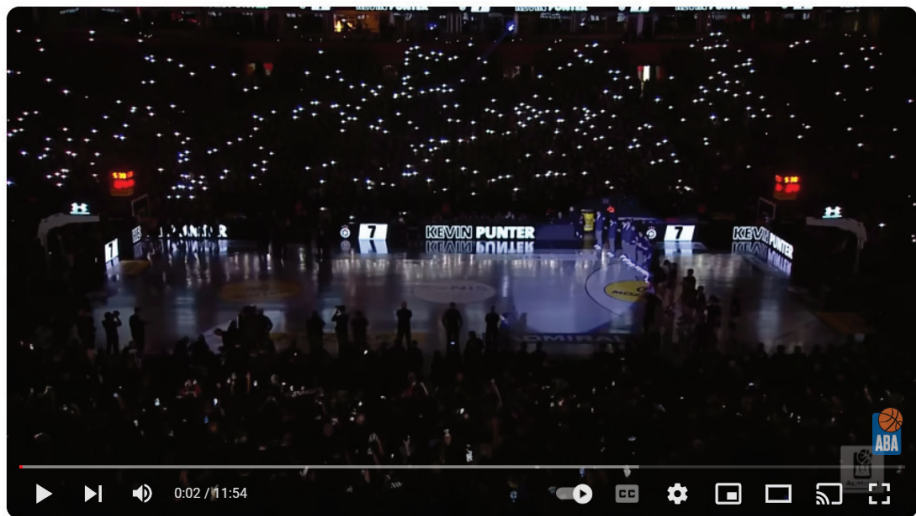
Belgrade crowd honours the memory of Dejan Milojević (Partizan Mozart Bet – Mega MIS, 22.1.2024)

YOUTUBE VIDEO LINK (or click the image below to watch): https://youtu.be/_B-CenHLE4?si=dafVzi1jrjFvPNjY .