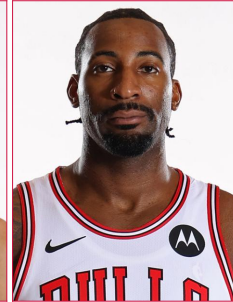
3 Andre Drummond Center Connecticut