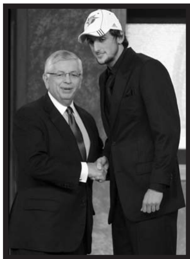
With the 18th overall pick in the 2007 NBA Draft, the Golden State Warriors selected Marco Belinelli.