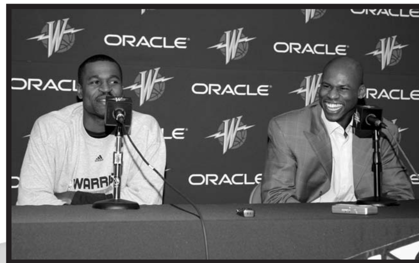
On January 17, 2007, the Warriors acquired Stephen Jackson and Al Harrington from the Indiana Pacers as part of an eight-player trade.

January 19, 2007 Re-assigned Patrick O'Bryant to the Bakersfield Jam of the NBA Development League. January 20, 2007 Baron Davis was suspended one game by the NBA for swinging at L.A. Clippers Quinton Ross on January 17. February 21, 2007 Recalled Patrick O'Bryant from the Bakersfield Jam of the NBA Development League. March 8, 2007 Re-assigned center Patrick O'Bryant to the Bakersfield Jam of the NBA Development League. March 29, 2007 Recalled Patrick O'Bryant from the Bakersfield Jam of the NBA Development League.