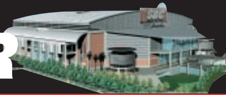
CHART YOUR COURSE TO THE SBC CENTER