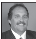
Stan Van Gundy