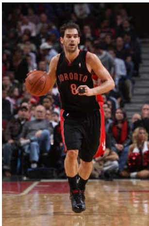
Jose Calderon led the team with a career-high 8.9 assists during 68 games.

finished the season with a 25-40 record. Chris Bosh was named to the All-Star team for the fourth time in his career but did not participate due to a sprained knee. On February 13, the Raptors traded centre Jermaine O'Neal, forward Jamarion Moon and a conditional draft pick to Miami for forward Shawn Marion, guard Marcus Banks and cash considerations. Jose Calderon became the all-time franchise leader in assists with his 1,792nd as a Raptor on March 13 vs. Detroit. Toronto set a franchise-record for points March 29 in defeating the Chicago Bulls 134-129 in overtime. Jose Calderon had a franchise high-tying 19 assists March 29 vs. Chicago. The Raptors had a season-best six-game win streak from March 22 - April 4 and finished the season with nine wins in the final 13 games. In the 27 games following the All-Star break, Toronto compiled a 12-15 (.444) record versus a 21-34 (.382) mark prior to the break. Chris Bosh was one of three players in the NBA to average 20 points and 10 rebounds or assists (Dwight Howard, Chris Paul) in