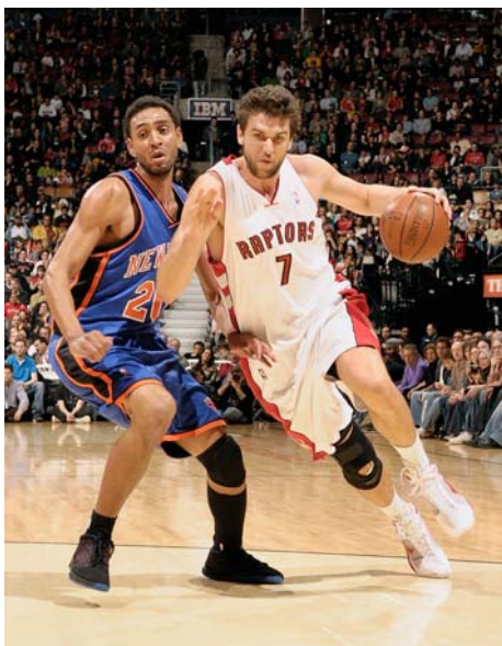
Andrea Bargnani averaged a career-high 15.4 points and 5.3 rebounds in 2008-09.

finished the season with a 25-40 record. Chris Bosh was named to the All-Star team for the fourth time in his career but did not participate due to a sprained knee. On February 13, the Raptors traded centre Jermaine O'Neal, forward Jamarion Moon and a conditional draft pick to Miami for forward Shawn Marion, guard Marcus Banks and cash considerations. Jose Calderon became the all-time franchise leader in assists with his 1,792nd as a Raptor on March 13 vs. Detroit. Toronto set a franchise-record for points March 29 in defeating the Chicago Bulls 134-129 in overtime. Jose Calderon had a franchise high-tying 19 assists March 29 vs. Chicago. The Raptors had a season-best six-game win streak from March 22 - April 4 and finished the season with nine wins in the final 13 games. In the 27 games following the All-Star break, Toronto compiled a 12-15 (.444) record versus a 21-34 (.382) mark prior to the break. Chris Bosh was one of three players in the NBA to average 20 points and 10 rebounds or assists (Dwight Howard, Chris Paul) in