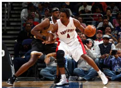
Chris Bosh led the team with 22.7 points and 10.0 rebounds last season.

The Toronto Raptors finished with a 33-49 record, missing the postseason for the first time since the 2005-06 season. The Raptors were 18-23 at home and 15-26 on the road. Toronto set a franchise record with an .824 free throw percentage (1534-for-1861, first in the NBA). The .824 mark is the third-best team free throw percentage in NBA history. Toronto finished fifth in the NBA in averaging 23.0 assists. Toronto's NBA record consecutive game streak with at least one three-point field goal made continued and is now at 860. Toronto acquired forward Jermaine O'Neal and the draft rights to centre Nathan Jawai in exchange for guard T.J. Ford, forward Rasho Nesterovic, forward Maceo Baston and the draft rights to centre Roy Hibbert on July 9. Chris Bosh received his fifth NBA Player of the Week for the week of Oct. 28 – Nov. 2. Bosh scored 40 points and grabbed 18 rebounds November 18 at Orlando. Sam Mitchell was relieved of head coaching duties and assistant coach Jay Triano was named head coach on an interim basis on December 3. Triano