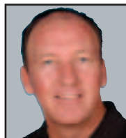
HEAD COACH Mike Dunleavy