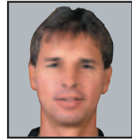
HEAD COACH Jeff Bzdelik