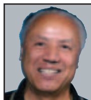
HEAD COACH Lenny Wilkens