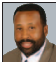
HEAD COACH Mike Woodson