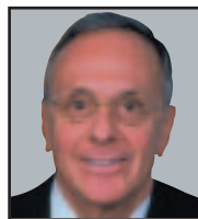
HEAD COACH Larry Brown