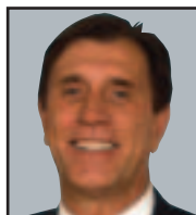
HEAD COACH Rudy Tomjanovich