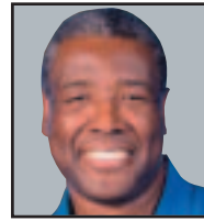
HEAD COACH Paul Silas