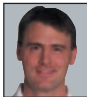
HEAD COACH Rick Carlisle