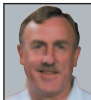
HEAD COACH Rick Adelman