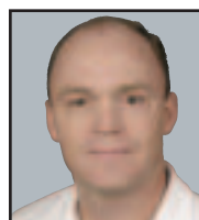
HEAD COACH Scott Skiles