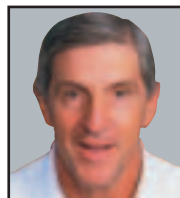
HEAD COACH Jerry Sloan