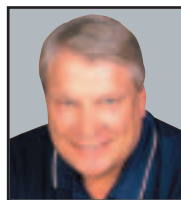
HEAD COACH Don Nelson