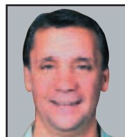
HEAD COACH Phil "Flip" Saunders