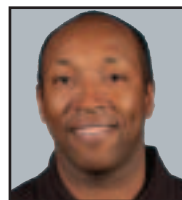
HEAD COACH Johnny Davis