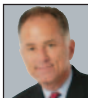
HEAD COACH Jim O'Brien