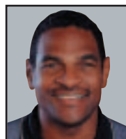
HEAD COACH Maurice Cheeks