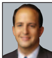
HEAD COACH Jeff Van Gundy