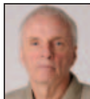
HEAD COACH Hubie Brown