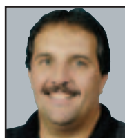
HEAD COACH Stan Van Gundy