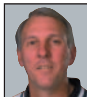
HEAD COACH Greg Popovich