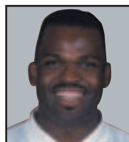
HEAD COACH Nate McMillan