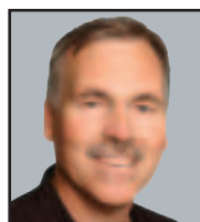
HEAD COACH Mike D'Antoni