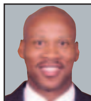
HEAD COACH Byron Scott