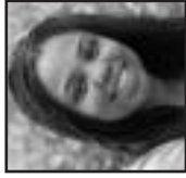
Jemele Hill Orlando Sentinel