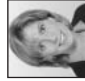
Denise Cullen Central FL News 13