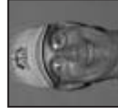
Shet Decker WOTM-AM