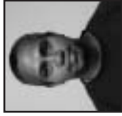
Fred Goodall AP