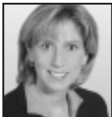
Denise Cullen Central FL News 13