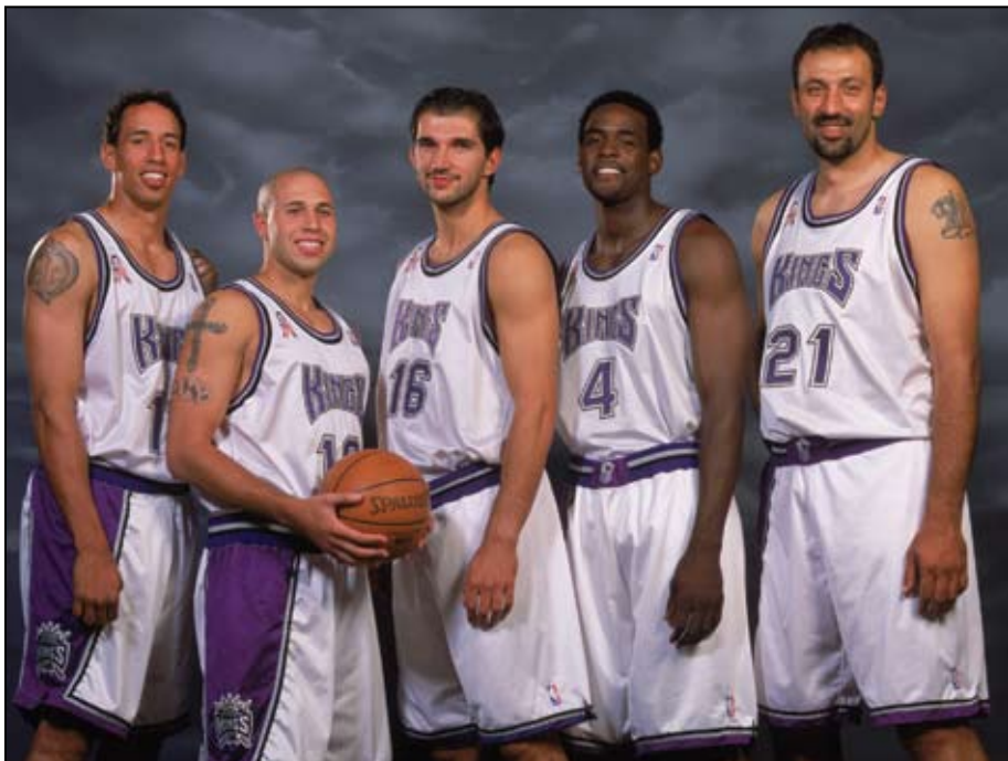
2001-02 STARTERS (L-R): DOUG CHRISTIE, MIKE BIBBY, PEJA STOJAKOVIC, CHRIS WEBBER, VLADE DIVAC

DID YOU KNOW ... Heading into the 2008-09 season, 379 players have worn a Kings or Royals uniform in at least one regular season game. In the franchise's 59-year history, #20 (24 players) has been the most popular uniform number, followed by #15 (18 players), #21 (16 players), #22 (15 players), and #23 (15 players). The most common names in franchise history are Williams (8 players), Smith (7 players), and Johnson (6).