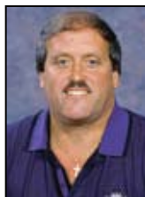
Del Enos Statistical Crew