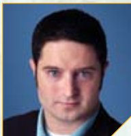
Benjamin Hochman Times-Picayune