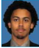
DJ McConduit Production Intern