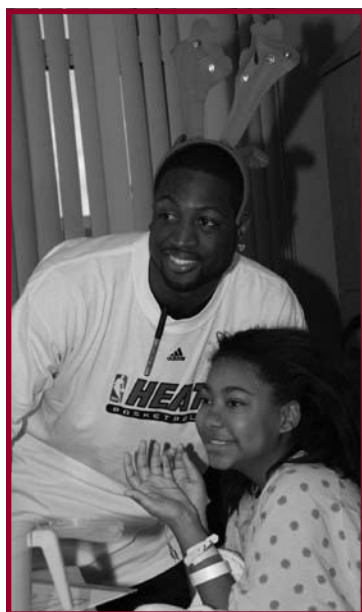
Dwyane Wade, shown bringing a smile to a patient at Holtz Children's Hospital at Jackson Memorial during the holidays, was awarded the NBA's Community Assist Award for the month of August 2007. It marked the second time Wade has received the league honor.