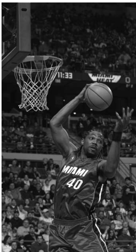
Udonis Haslem has led the HEAT in offensive rebounds, defensive rebounds, total rebounds, rebound average and double-doubles in each of the past two seasons.