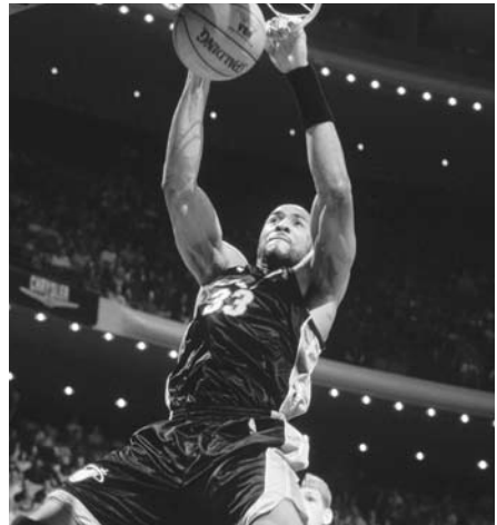
Alonzo Mourning ranks second on Miami's all-time field goal percentage list.