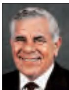
WILLIAM W. WIRTZ