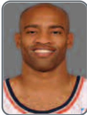
Vince Carter, Nets University of North Carolina