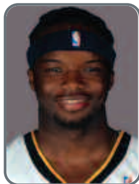
Jermaine O'Neal, Pacers Columbia, SC