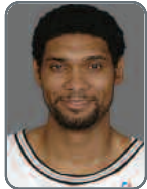
Tim Duncan, Spurs Wake Forest University