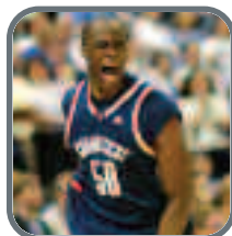
Emeka Okafor 2nd Pick Overall (2004)