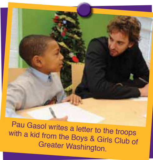
Pau Gasol writes a letter to the troops with a kid from the Boys & Girls Club of Greater Washington.