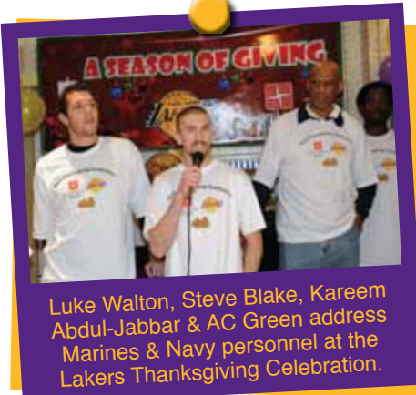
Luke Walton, Steve Blake, Kareem Abdul-Jabbar & AC Green address Marines & Navy personnel at the Lakers Thanksgiving Celebration.