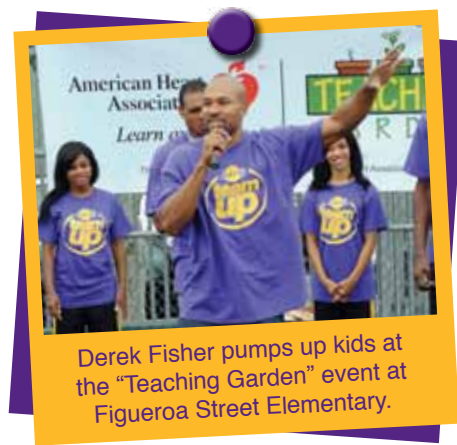
Derek Fisher pumps up kids at the "Teaching Garden" event at Figueroa Street Elementary.