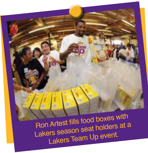
Ron Artest fills food boxes with Lakers season seat holders at a Lakers Team Up event.