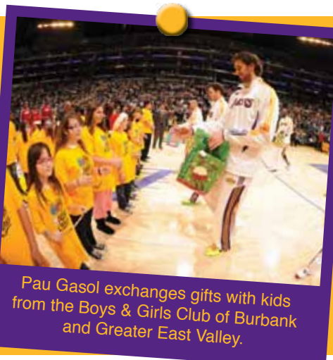
Pau Gasol exchanges gifts with kids from the Boys & Girls Club of Burbank and Greater East Valley.