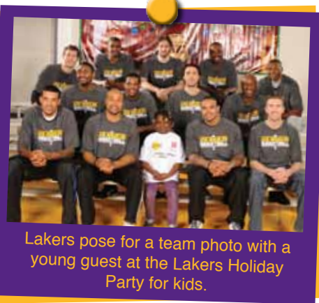
Lakers pose for a team photo with a young guest at the Lakers Holiday Party for kids.